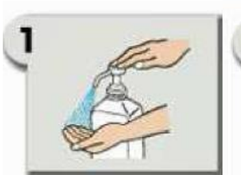
Take about 3 ml of sanitizer in the palm of your hand (about one pump).