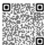
Our Life affairs guidance