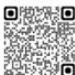
Our Life affairs guidance