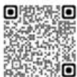
Our Life affairs guidance