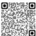
Our Life affairs guidance