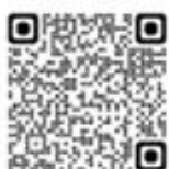
Our Life affairs guidance